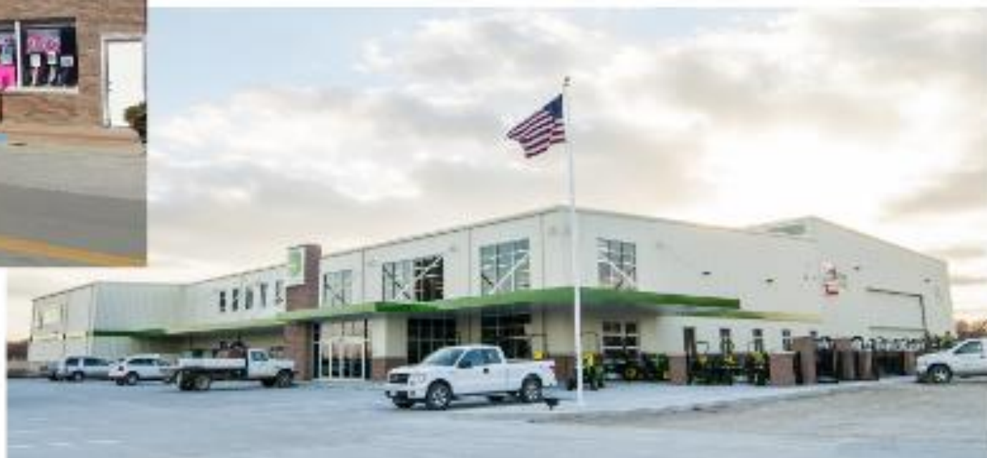
Heritage Tractor - John Deere dealership